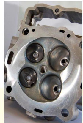
APL Performance Bikes P:+61 2 4575 1116